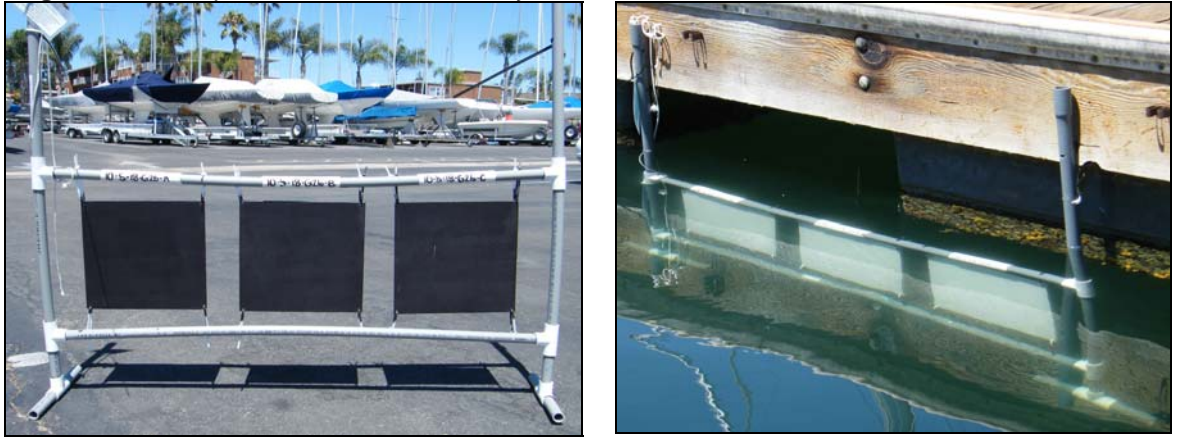
Figure 3-1. Complete Test Panel Assembly Installed On Dock

PVC frames were constructed to stabilize the panels so that a vertical position could be maintained at all times in the water. The PVC frames were modeled after test frames designed by Dr. Geoff Swain (Florida Institute of Technology, Center for Corrosion and Biofouling Control). An example of the type of frame used is shown in Figure 3-1. Each PVC frame held three fiberglass panels comprising a panel assembly. Panels were attached to the PVC frame with cable tie wraps on each corner. The PVC frames were then attached to floating docks and submerged so that the top of each panel was 12 inches under the surface of the water. PVC poles attached to the PVC frame connected the frame to the floating dock.