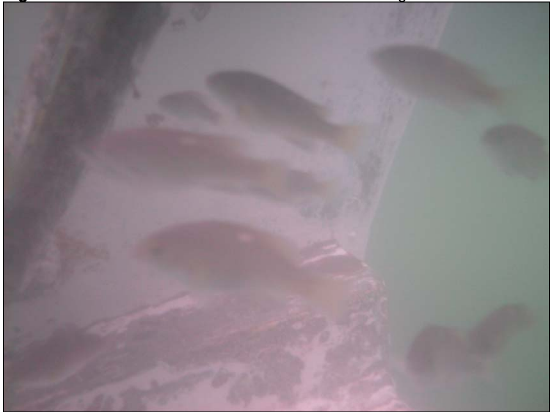
Figure 6-2. Surf Perch near Intersleek 900 Test Coating

A unique situation arose with Intersleek 900 during the study. Small imprints were observed on the bottom of both boats (Quadrants I-IV). Upon closer examination the Project Team concluded the imprints were caused by fish, such as surfperch. In fact, during one inspection of the 30'sail boat, the hull cleaner observed surfperch actively nipping at the boat hull (Figure 6-2). At the conclusion of the study, there did not appear to be any structural side effects of the feeding of the surfperch. There is concern that this feeding behavior may potentially lead to coating damage, and the potential effect on long term performance is unknown.